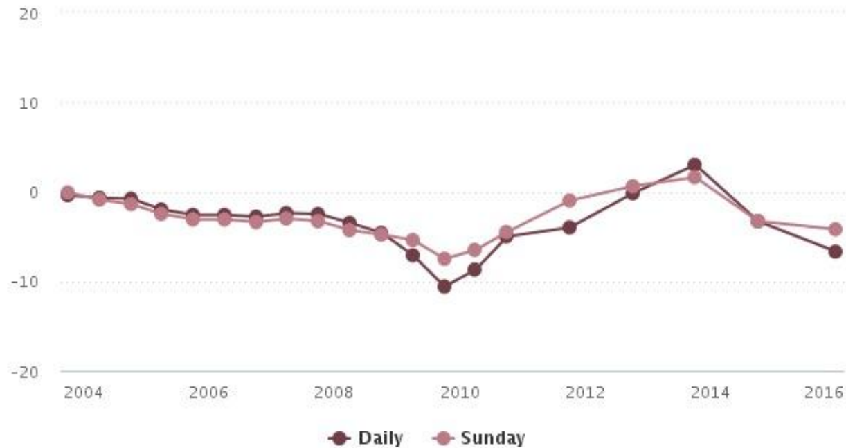
% change in average weekday and Sunday circulation